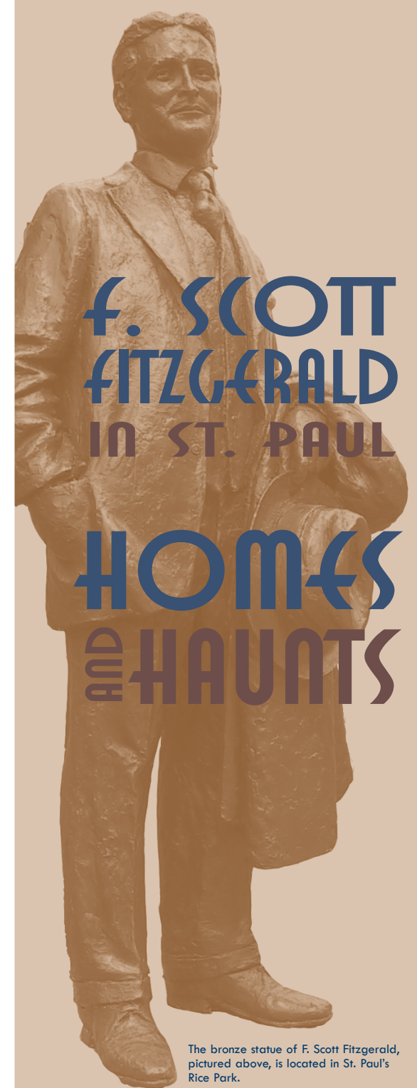
The bronze statue of F. Scott Fitzgerald, pictured above, is located in St. Paul's Rice Park.