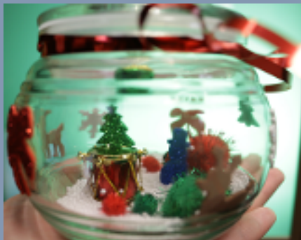
Waterless snow globes.

Visit spl.org to register and check for changes to regularly scheduled programs during the holiday weeks.